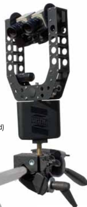
This shows an inverted Narrow head Clamped to an accessory arm.

For more information on accessories and options please call +44 (0) 1234 855 222 or visit www.polecam.com